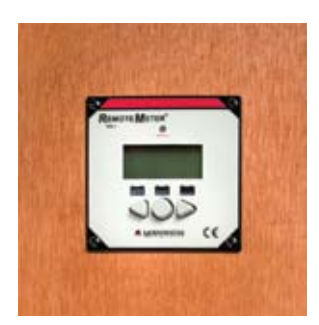
In Wall Mount